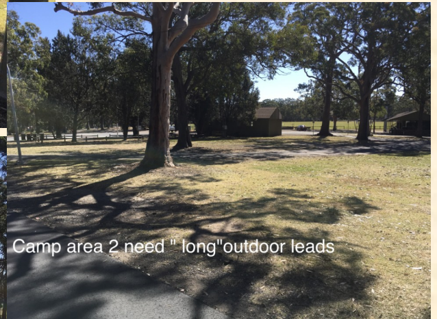
Camp area 2 need "long" outdoor leads