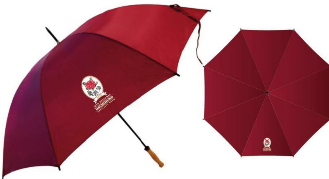
"Umbrellas with National Logo on One Panel" $20.00