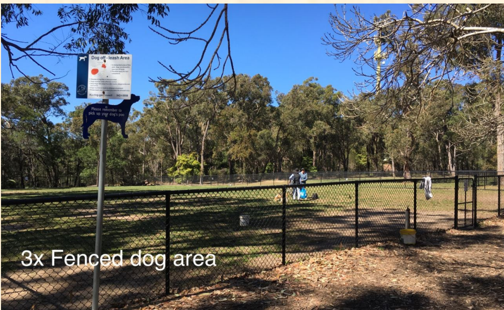
3x Fenced dog area