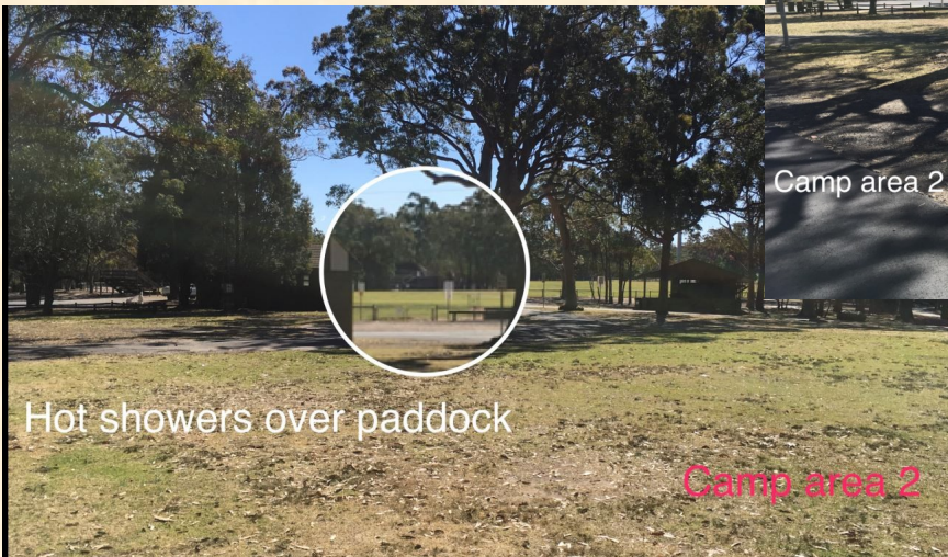
Hot showers over paddock