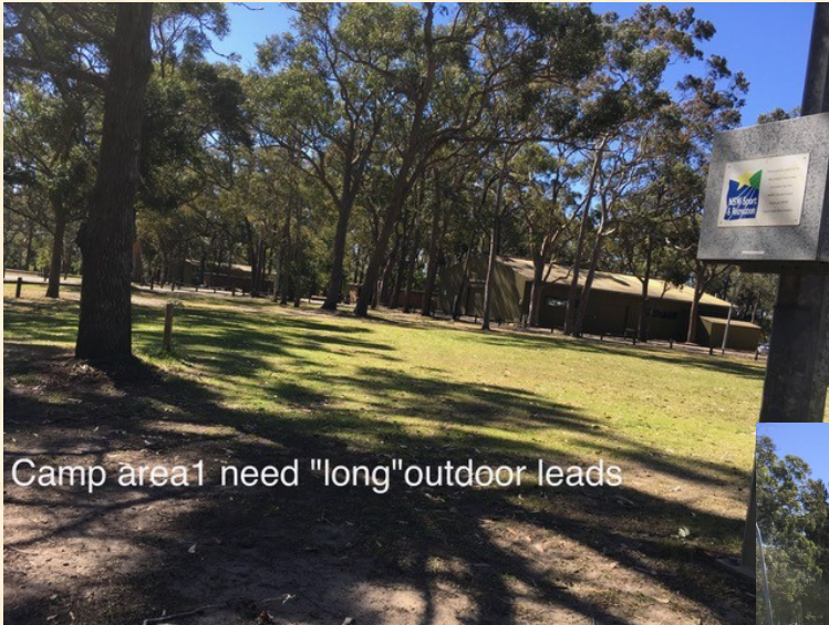
Camp area 1 need "long" outdoor leads